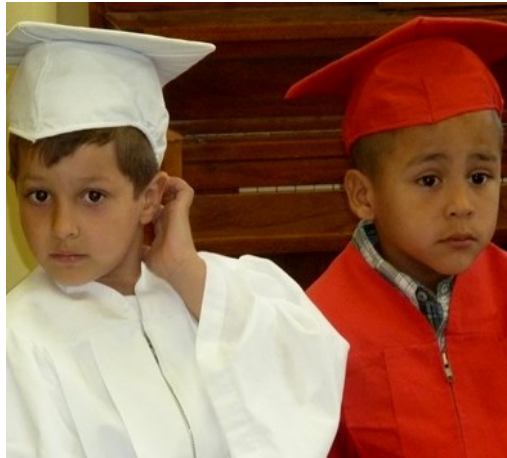
School readiness skill development for children and families is at the heart of the mission of Head Start programs here and across the nation.